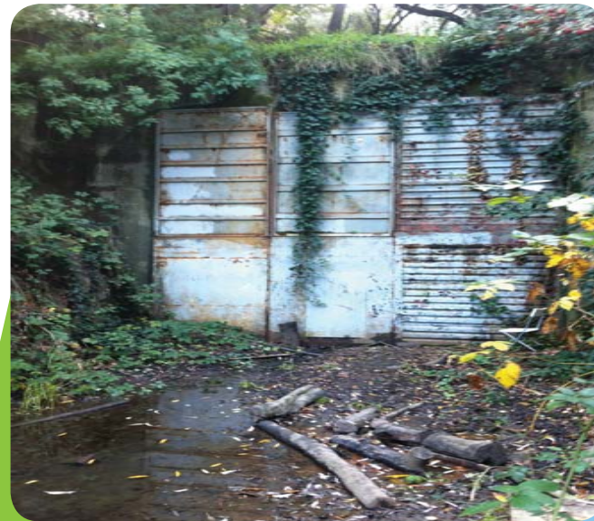
Alto Tunnel north portal entrance.

The Board of Supervisors authorized additional federal Non-motorized Transportation Pilot Program (NTPP) grant funds to further refine cost estimates and further investigate