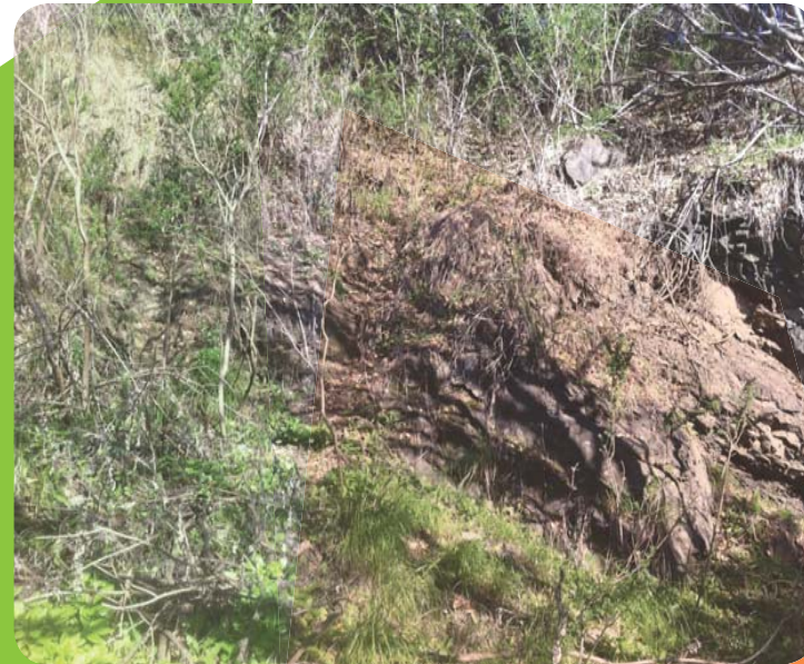
Alto Tunnel south portal.